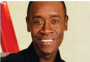
DON CHEADLE Goodwill Ambassador