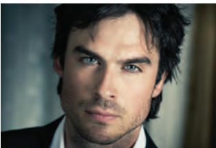
IAN SOMERHALDER Goodwill Ambassador