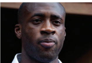
YAYA TOURÉ Goodwill Ambassador