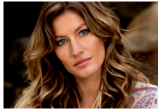
GISELE BÜNDCHEN Goodwill Ambassador