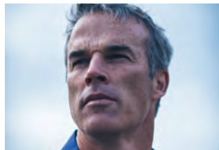
LEWIS PUGH Patron for Oceans