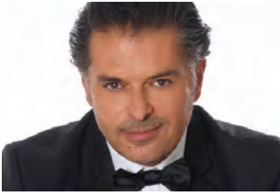
RAGHEB ALAMA Goodwill Ambassador, Arab Region