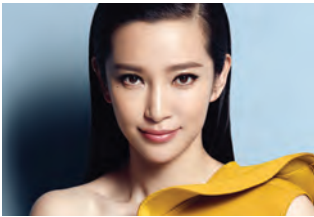
LI BINGBING Goodwill Ambassador